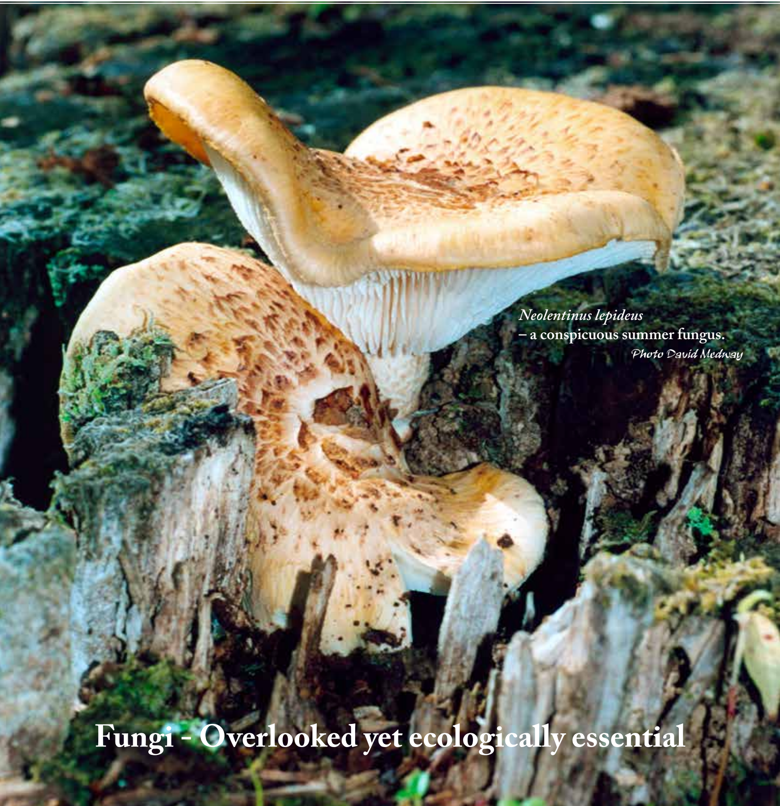
Neolentinus lepideus – a conspicuous summer fungus.