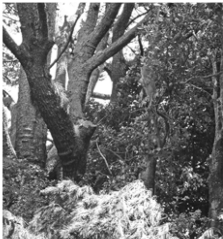
Minor branch drops.

The damage caused to understory and adjacent vegetation by fallen branches and trees may set back the regeneration process by many years. It is estimated that canopy replacement could be advanced by some twenty years if appropriate trees were intentionally established in a damaged area. But should we interfere with nature?