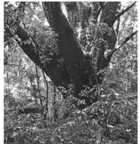
A lot more to come!