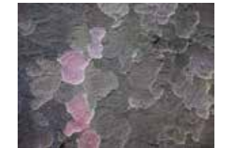
#5 Prumnopitys taxifolia Matai