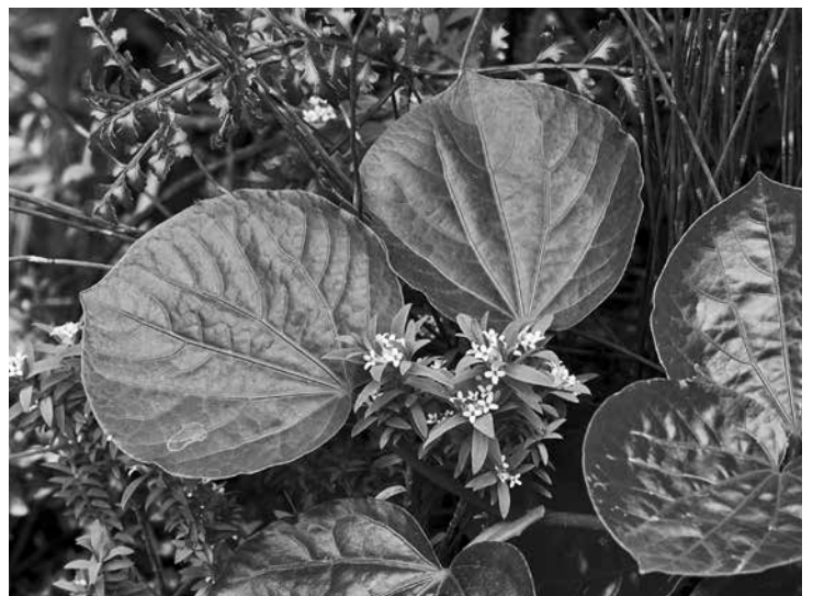
A selection of shape and texture from the native collection