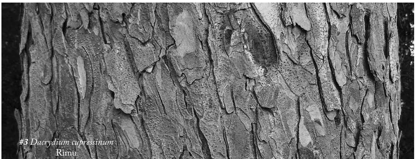
#3 Dacrydium cupressinum Rimu

The podocarps form a substantial part of most forests in New Zealand, and are an essential food source for birds. They were a valuable timber source, but felling is now strictly controlled. Uses ranged from Totara wood for wakas, roof shingles, and railway sleepers to Kahikatea wood used for cheese and butter boxes. Now old railway sleepers are recycled with the most unusual product being for skincare using the extracted antibacterial “totarol”.