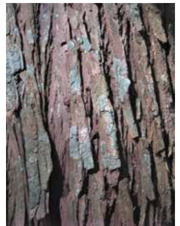
#7 Podocarpus totara Totara