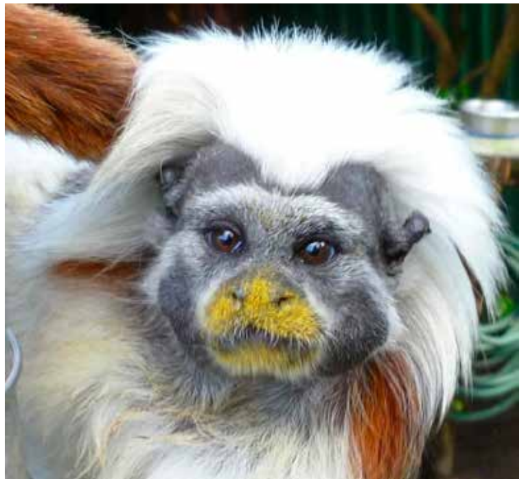
Nephrite enjoying cherry pollen

All of our animals benefit from items sourced in the Park. Our Meerkats will spend hours ripping apart rotten logs, and searching for the tasty bugs inside. This is an excellent opportunity for our visitors to understand just how powerful their claws and teeth are as they engage in this natural behaviour. Spring is a great time to source enrichment from the park as flowering Cherry blossoms, Hibiscus flowers, fruiting Coprosma, and many other treats are enjoyed by our Cotton-top Tamarins and many of our free-flight birds. Pine cones can be stuffed with anything you can imagine and presented in numerous ways, from freezing them to hanging them from trees like Christmas decorations. New mulch from fallen trees in the Park is enjoyed by many as the new scents can be an interesting new addition to an enclosure. Chipped Pohutakawa seems to be the current favourite and it does smell divine. Even our locusts, which are fed out to the Zoo animals, get to enjoy freshly picked grass and are popular with most of the less squeamish visitors to the Zoo office!