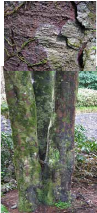
#4 Prumnopitys ferruginea Miro