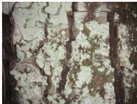
#8 Dacrycarpus dacrydioides Kahikatea