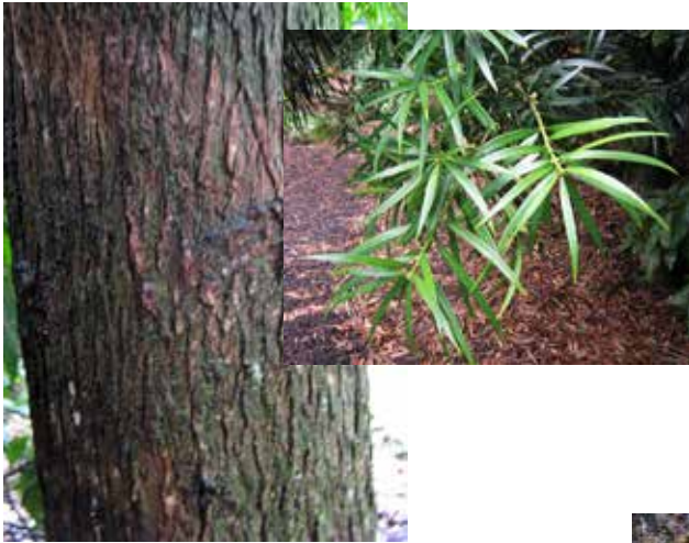
#1 Podocarpus henkelii Henkel's Yellowwood