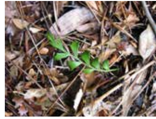
#2 Phyllocladus trichomanoides Tanekaha/Celery Pine