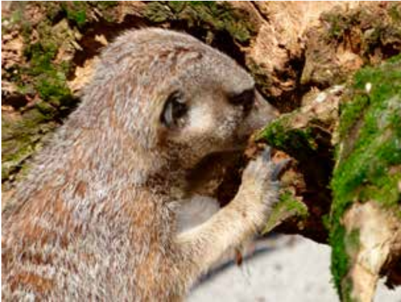
Mtoto searching for bugs in rotten wood

In the wild, animals spend most of their time searching for food, raising their young, and keeping safe from predators. By providing the best care possible for our Zoo animals, a lot of these natural behaviours are no longer needed and they can become inactive or develop unwanted behaviours. We want to keep our animals as physically and mentally healthy as possible and enrichment is one of the tools keepers have to accomplish this. Enrichment is our way of making the animals' environment stimulating and sometimes challenging through the use of scent, food, objects, and training.