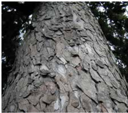
#3 Dacrydium cupressinum Rimu