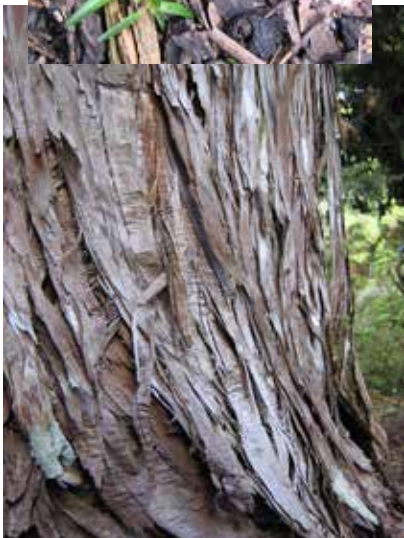
#6 Podocarpus hallii Hall's Totara