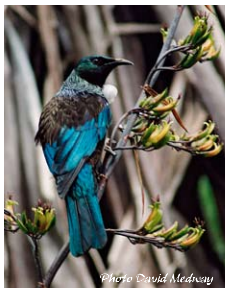
Tui on Phormium cookianum (since removed) in Pukekura Park

Any whim of beautification could so easily wipe out an important source of food for birds. Park staff and Friends need to know, respect and preserve those important plants.