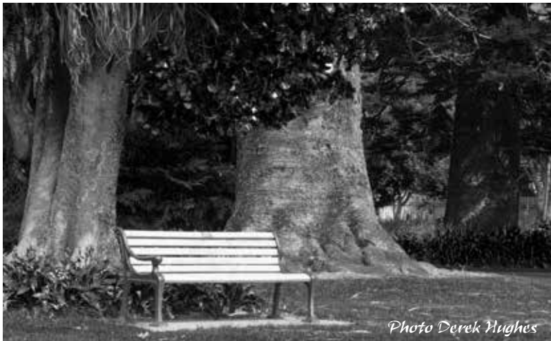
The park bench gives an indication of the size of one of the historic Norfolk Island Pines (centre) at Brooklands

The Araucaria trees in Pukekura Park and Brooklands are only a small representation of a fabulous family. The more-recently planted specimens have extended and enhanced the collection. Several other Araucaria species are also perfectly suited to this region. Araucaria have many great attributes. They are usually large growing, long-lived, disease-free trees which makes them first-rate specimens. They tend to be a focal point within any landscape. The common name may be somewhat misleading, but that is of little consequence. Araucaria are amongst the tree world's aristocracy. Take a closer look next time, and tip your hat.