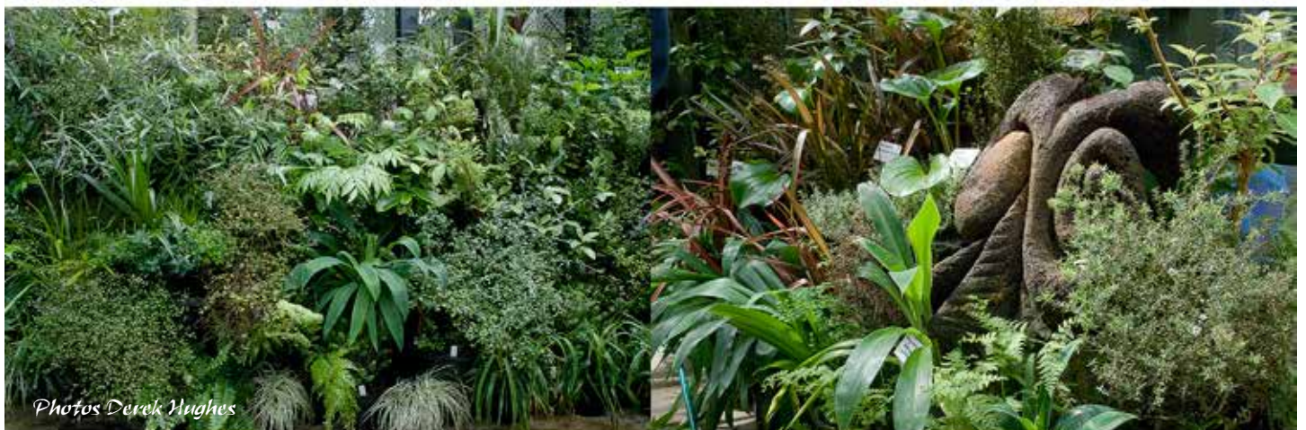
Below: A section of the New Zealand native plant display in the entrance to the Kibby House