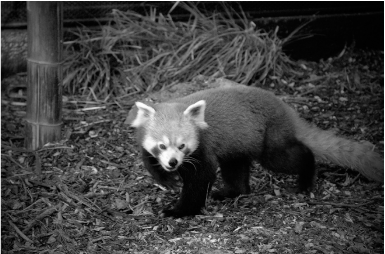
“Mungo” the Red Panda at Brooklands Zoo

With summer approaching and visitor numbers increasing, Zoo staff are starting up a volunteer program. Volunteers provide much needed and appreciated support to our staff and animals. We are looking for people who are highly motivated, passionate about animals, and can work as part of a team. Our volunteer program will offer a wide range of activities depending on experience and knowledge. Volunteers will receive full training. We ideally require our volunteers to be able to commit to a regular time slot so that they and our animals become familiar with each other and so that they become part of the Zoo team. If this sounds like something you would like to participate in please contact Sarah at (06) 7695320. The first training session will occur in October 2008.