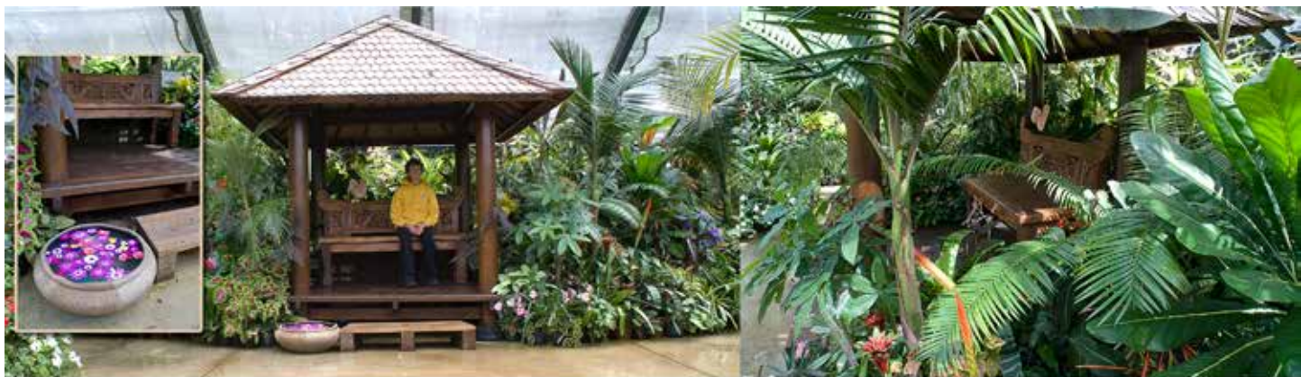
Above: Balinese pavilion in a wonderful tropical setting

The Rhododendron and Garden Festival is on from 31 October until 9 November. There will be daily tours through the Fernery at 1.30pm, meeting at the main Fernery entrance by the Fred Parker Lawn.