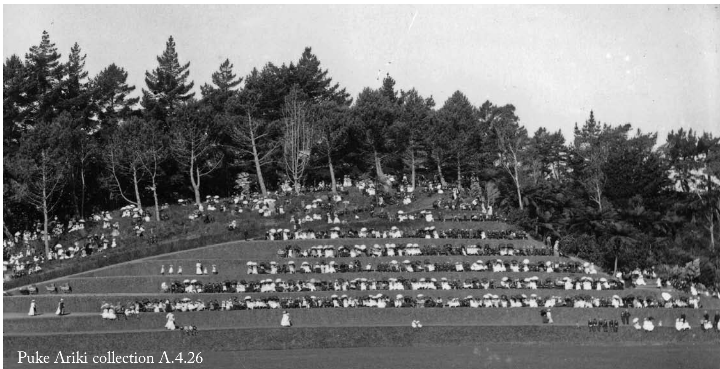
Puke Ariki collection A.4.26

are shown in the accompanying photograph by A.W. Reid of Stratford, now in Puke Ariki (A.4.26), which is undated but which, from internal evidence, was probably taken in the 1910s. There were 14 large pine trees on the eastern skyline in November 1931 at the height of the public controversy about their proposed removal and the removal of other pines in the Park ( Taranaki Herald 11/11/1931). The Park Committee, on the recommendation of the Superintendent and despite considerable opposition, eventually resolved to have the pines on the eastern