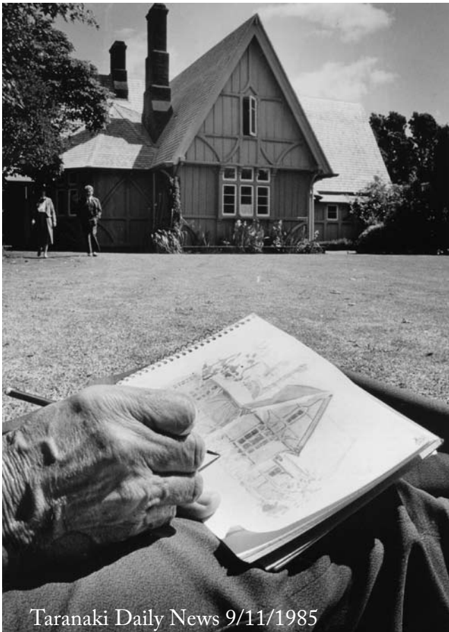
Taranaki Daily News 9/11/1985

opened in November 1985. One aspect of the restoration that proved somewhat controversial was the abandoning of the “Elizabethan” colour scheme that the Kings adopted for the building. Before that, photographs show the building had been unpainted, or possibly oiled. The grey scheme adopted was designed to re-create that original unpainted appearance.