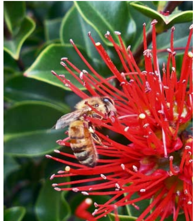
Honeybee on Metrosideros 'Mistral' flower 22 November 2009