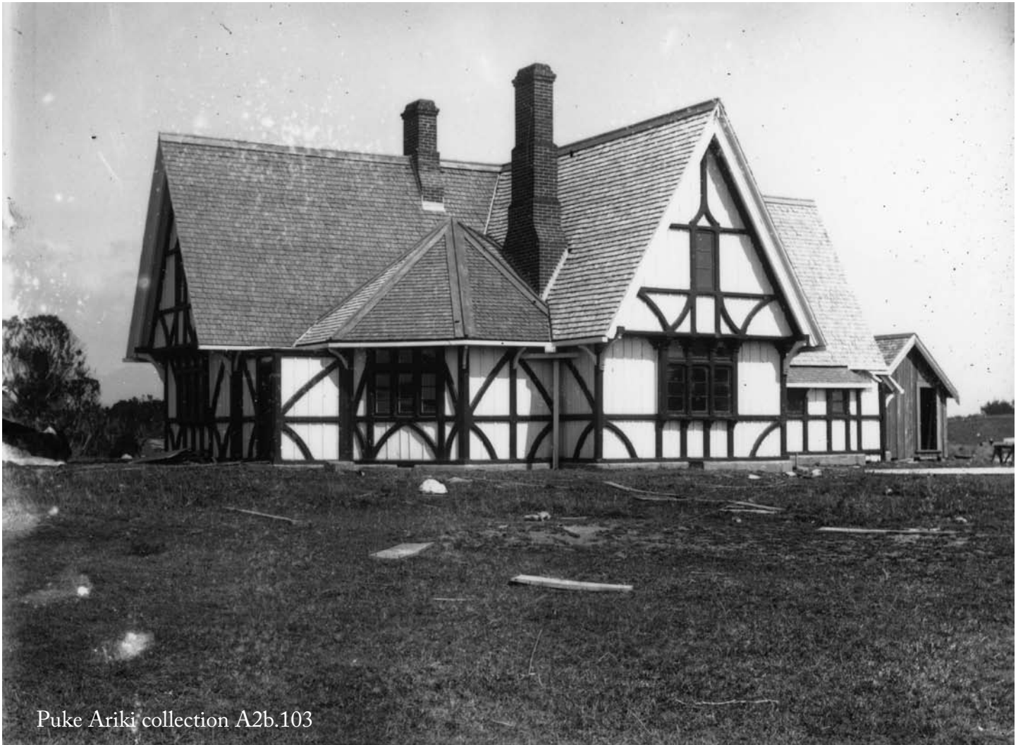
Puke Ariki collection A2b.103