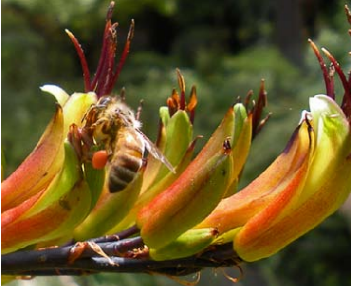
Honeybee on Phormium cookianum flower 17 November 2009