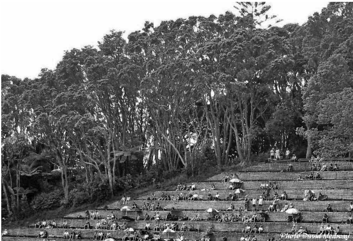
Pohutukawas above the eastern terraces at the Sportsground