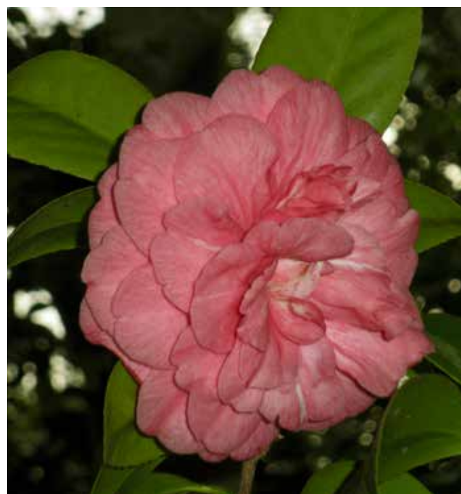
Flowers of Camellia japonica 'Triumphans'.