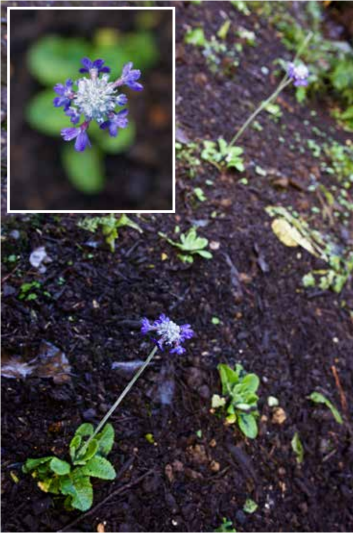
Primula denticulata in the newly mulched and planted beds in Primula Dell

new Hosta varieties - 'Blue Angel', 'Francee', 'Golden Tiara' and 'Loyalist' - will also be planted in the near future. We have re-introduced Neomarica caerulea , a member of the Iris family which used to be in Primula Dell garden many years ago and has pale blue-lilac outer sepals and heavily purple-striped inner petals.