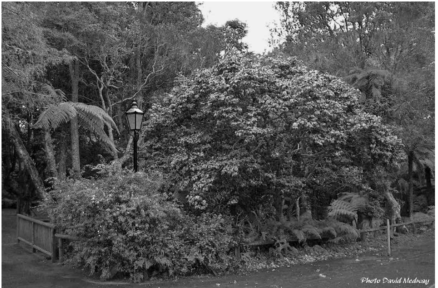
Camellia japonica ‘Triumphans’ beside main lake outlet

I mentioned in an earlier article ( Supplement to Newsletter of Friends of Pukekura Park 2(2) (October 2007) that it is not possible to identify most old Camellia japonica cultivars, even given that they have been named, without reference to the early illustrated Camellia literature, some of which is now available on the Internet. After researching the most relevant of this early and later literature, I am satisfied that the Camellia in question is a specimen of the old cultivar Camellia japonica ‘Triumphans’.