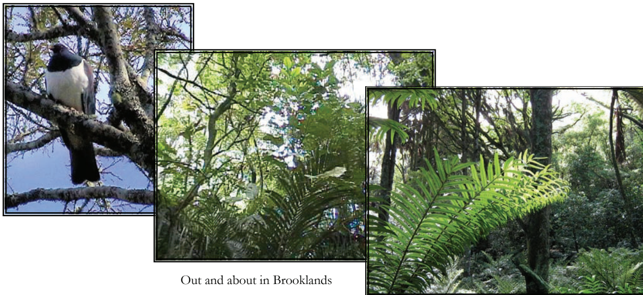
Out and about in Brooklands

Planting: The team has planted over 3,000 new plants around the park – in a range of sites. Look for new additions at the Rhodo Bank and Conifer Bank; Rhodo Dell path edges; Bowl crib wall; Kunming Garden; Wetland; Victoria Road car park; Bellringer Pavilion garden; Scanlan Walk; Japanese Hillside; Palm Lawn; Kaimata Street entrance; Kaimata Street frontage; Waterwheel; Brooklands; Zoo car park; Curiosity Walk; Horton Walk entrance; Fred Parker Lawn and Stainton Dell. Plus they have been in the Maranui Gully revegetation site and have laid down many new ferns throughout the park. The team is completing the tail-end of the plantings now and will be finished around mid November.