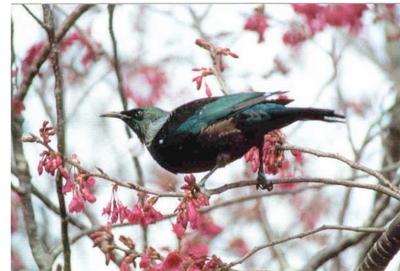
Tui on Prunus campanulata , Brooklands