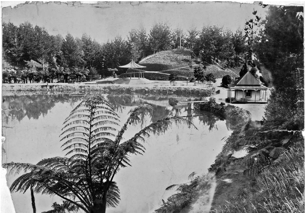
A view of the northern end of the main lake in the early 1890's.

The main lake was formed by closing off the valley during 1878. Interestingly, the spill was not channelled down the same valley but diverted into a lesser valley, now called the Sunken Garden, towards what is now the Sportsground. This involved hand-digging a channel about 100m long and 0.9m x 0.9m in cross-section from the edge of the lake around the eastern and northern side of what is now Cannon Hill to what is now Fountain Lake (created in 1893), but there was an obstruction through which an unlined tunnel had to be dug. The entrance to this tunnel is close to the Curator's office, but the exit is obscured behind Bellringer Pavilion. This made it a wet "Scotsman's entry" to the Sportsground for ticketed events, which I am told was popular with New Plymouth Boy's High School pupils "in the know". During my curatorship the tunnel was collapsed by a heavy vehicle passing over it en-route to the Band Rotunda area. This was repaired by excavation and insertion of about three 1.2m diameter concrete pipes beneath the carriageway only. Boundary fence alterations have removed its attraction as a secret free entry tunnel for wily pupils, but it is never-the-less a hidden treasure.