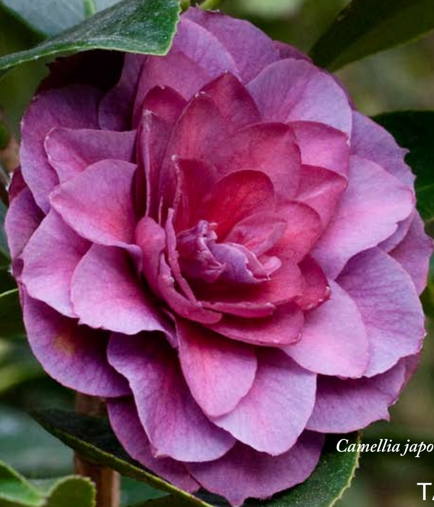
Camellia japonica 'Sir Victor Davies'