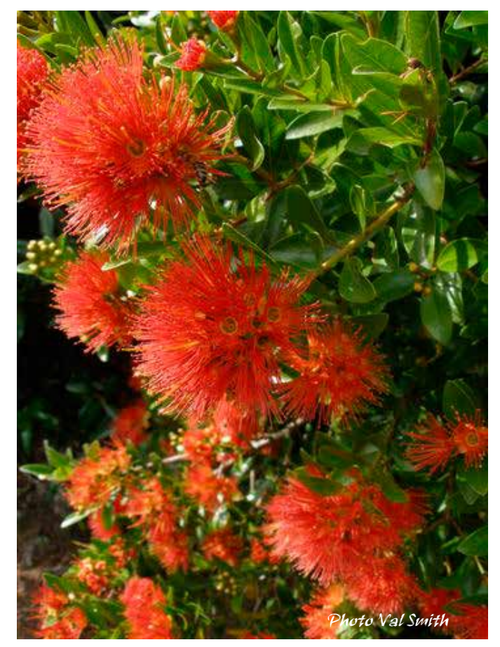
Above. Red Climbing Rata Akatawhiwhi ( Metrosideros fulgens ) Left. Wheki-ponga ( Dicksonia fibrosa ) at the lily pond