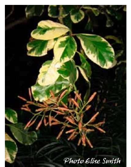
Parapara ( Pisonia brunoniana 'Variegata')

In spite of threatening rain and a wintry 10°C maximum temperature on 11 May 2009, eight stalwarts met at the Rogan Street entrance for another informative guided walk in Pukekura Park. Plan B, a more sheltered