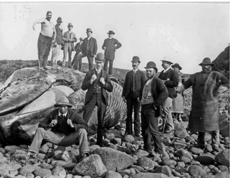
FoPP Magazine, Volume 4, N° 2. Page 9

Photograph W. A. Collis 8 December 1892 ARC2002-615 Puke Ariki Collection