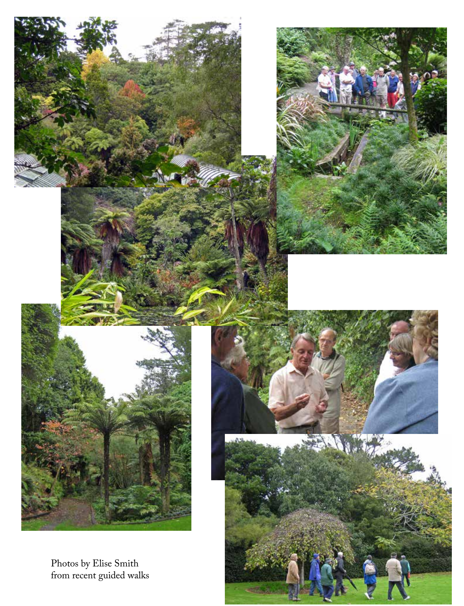
FoPP Magazine, Volume 4, N° 2. Page 8