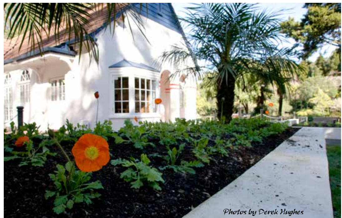
Printing sponsored by Graphix Explosion