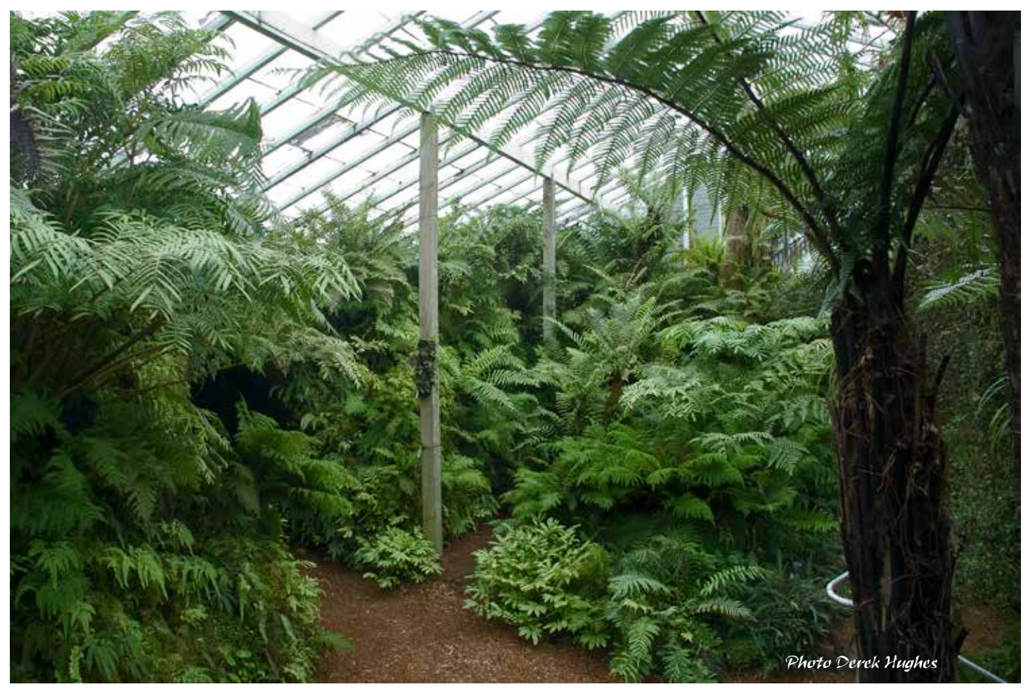
FoPP Magazine, Volume 4, N^{\circ} 2. Page 3